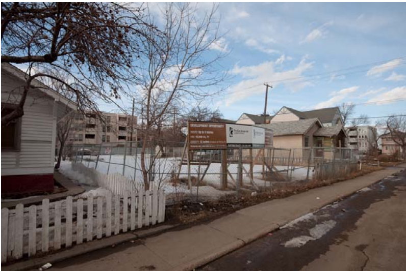
Wider view of the lot, facing north east.