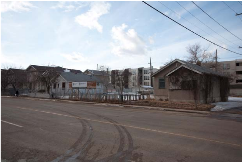
View of the lot, facing north.