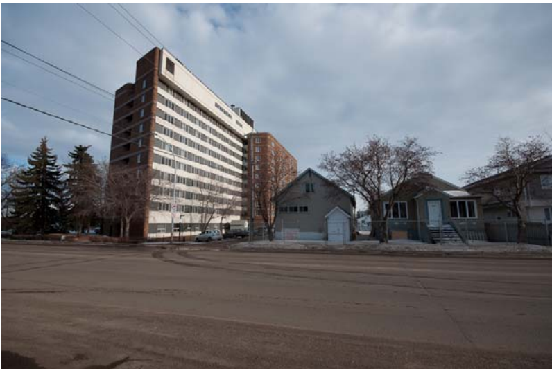
Buildings across 103A Ave from the lot, facing south east.