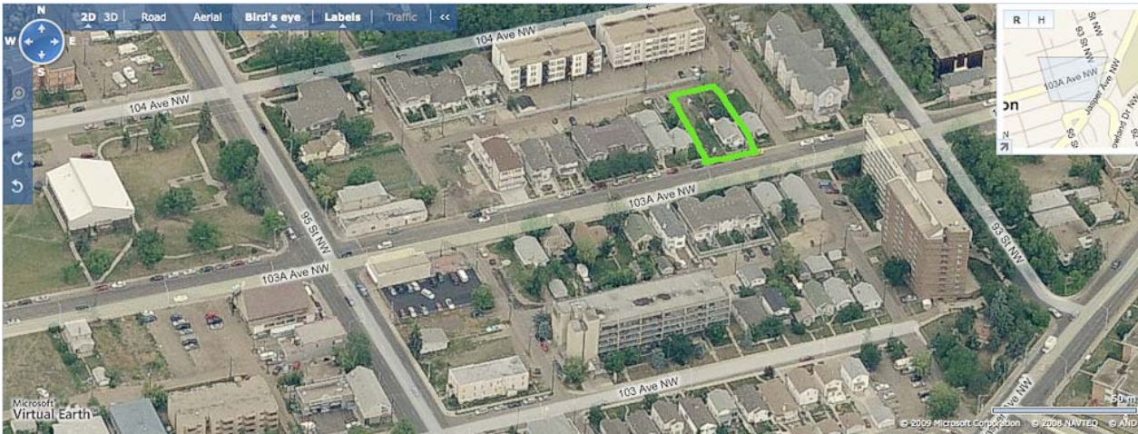
View of the double lot, outlined in green.