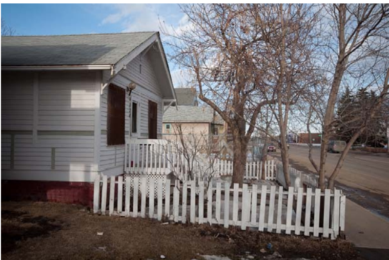
View of the neighbouring building to the west of the lot in the foreground, with the neighbouring east building in the background.