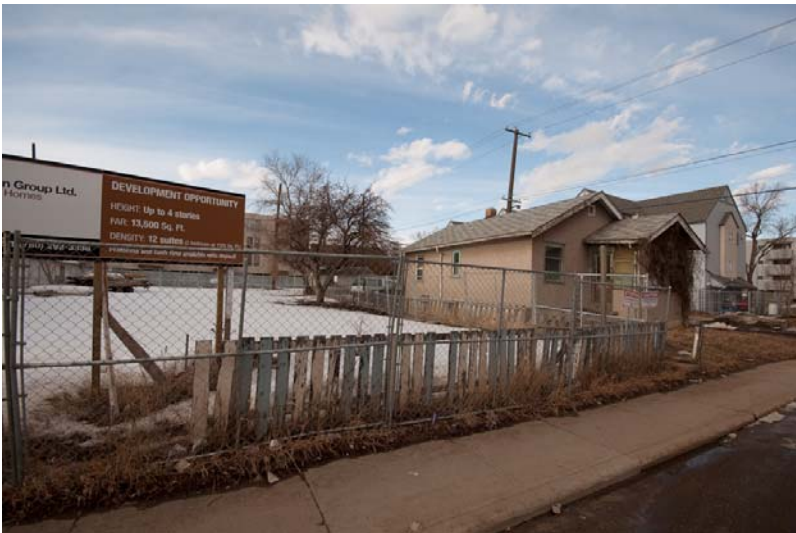
Eastern boundary of the lot, facing north east.