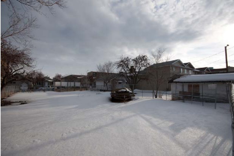
South view of the lot.