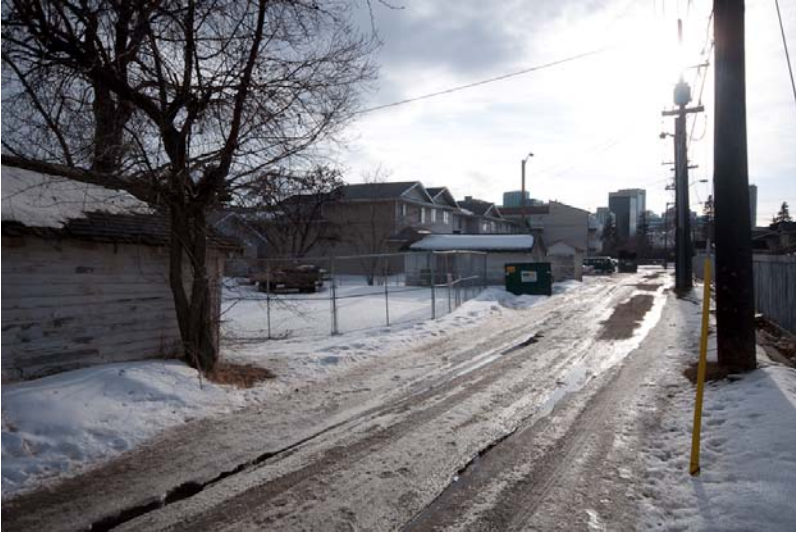
North boundary of the lot, facing west.