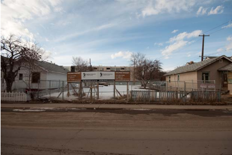
View of the lot from 103A Ave, facing north.