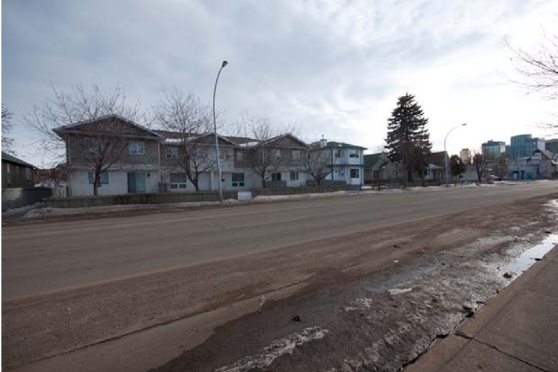
Buildings across 103A Ave from the lot, facing south west.