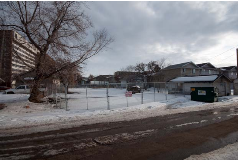
A south view of the lot, showing north boundary.