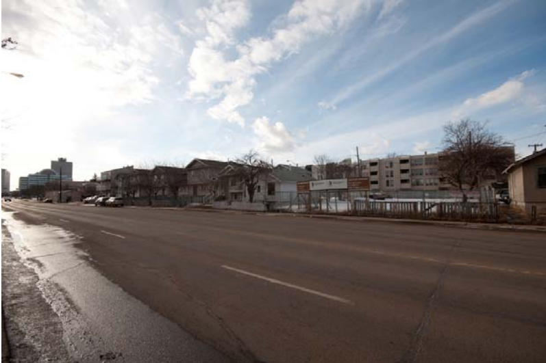
Wide view of the lot, with surrounding buildings on the north side of 103A Avenue.