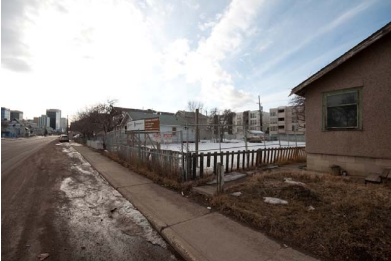
View of the lot, facing north west.