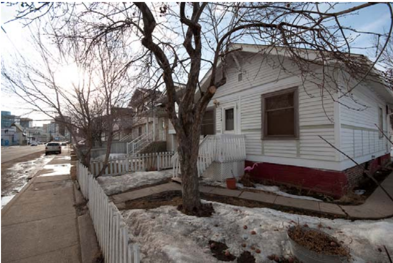
Neighbouring buildings to the west of the lot.