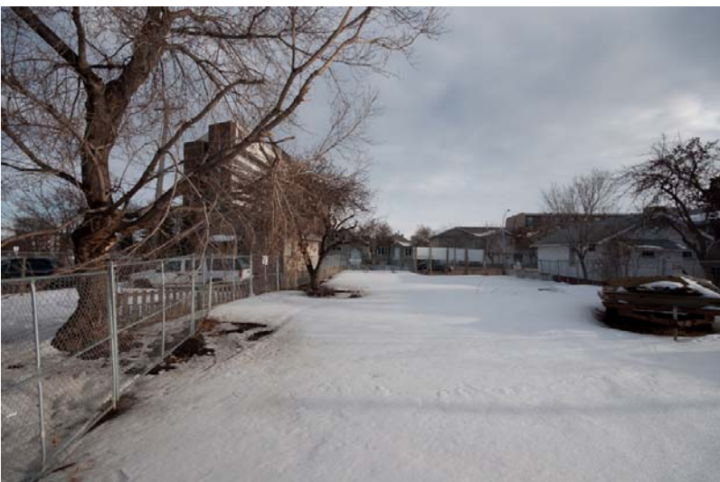
Facing south on the lot, taken from the north east corner.