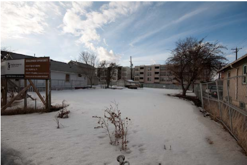
View of the lot from the south east corner.