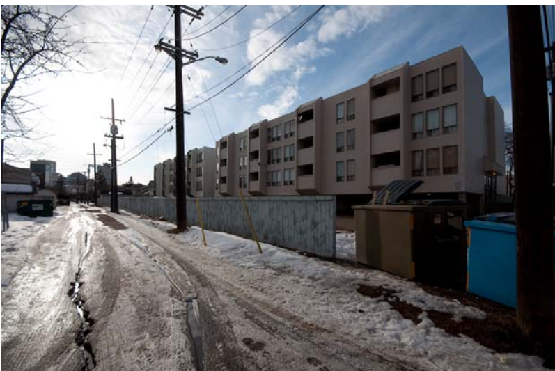
Back alley, located to the north of the lot, facing west.