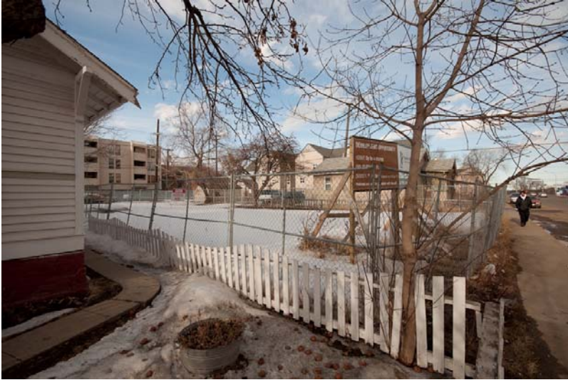
South west corner of the lot.