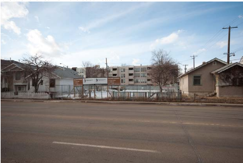
View of the lot from across the street, facing north.