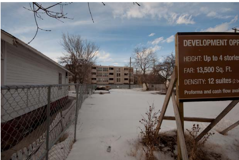
Western boundary of the lot.