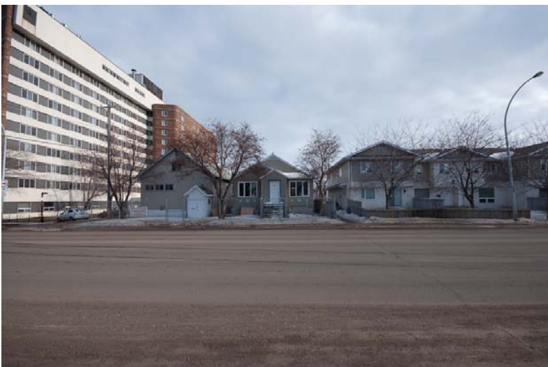
Buildings across 103A Ave from the lot, facing south.