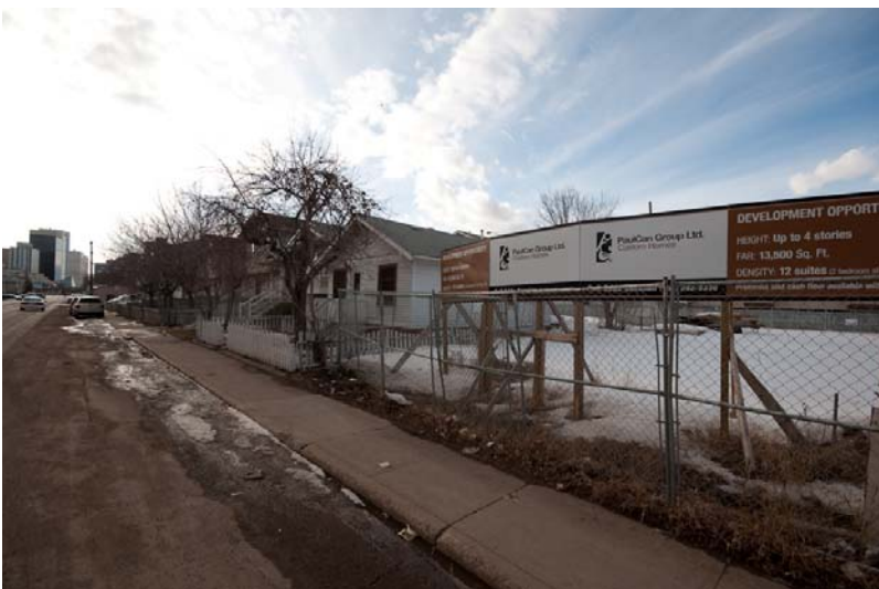
Southern boundary of the lot.