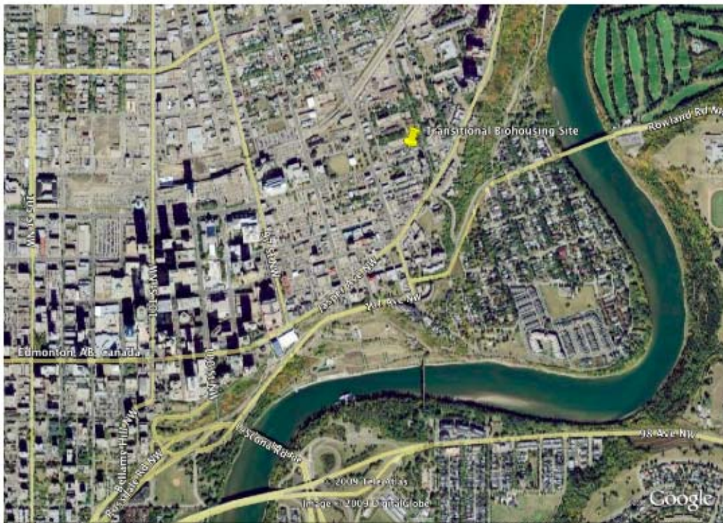
Downtown Edmonton with the site to the west.