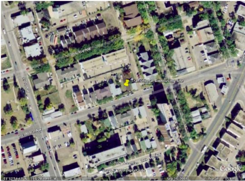
The site within the Boyle McCauley neighbourhood.