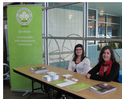
Volunteers at EcoShift Rady Jewish Community Centre