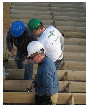
Assiniboine Credit Union & Manitoba Chapter CaGBC Habitat for Humanity Build Fall 2010.